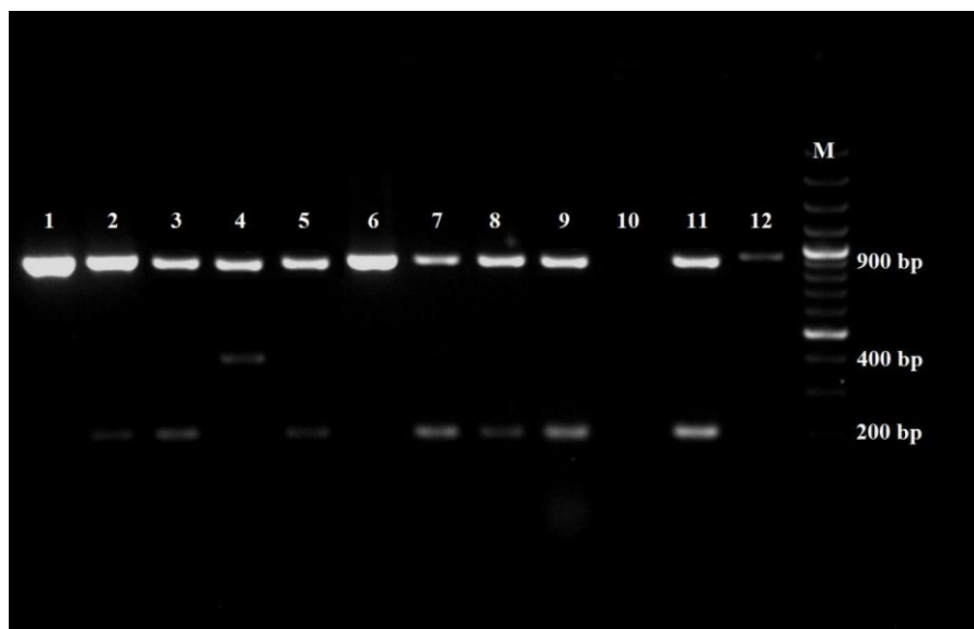
Figure 3. Lane 1 C. perfringens ATCC 13124; lanes 6 and 12: C. perfringens isolates type A strains with \alpha toxin ( cpa ); lanes 2, 3, 5, 7, 8, 9 and 11: C. perfringens type A with \alpha ( cpa ) and \beta 2 toxins ( cpb2 ); lane 4 C. perfringens type A with enterotoxin ( cpe ); lane 10 negative control ( Clostridium sporogenes ATCC 19404)

Gene for the enterotoxin ( cpe ) was detected in only one strain, which was isolated from the cow's organs.