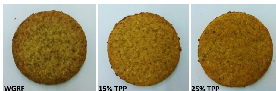
Figure 1. Cookies made of whole grain rye flour (WGRF) without and with tomato pomace powder (TPP) substitution (15% and 25%)